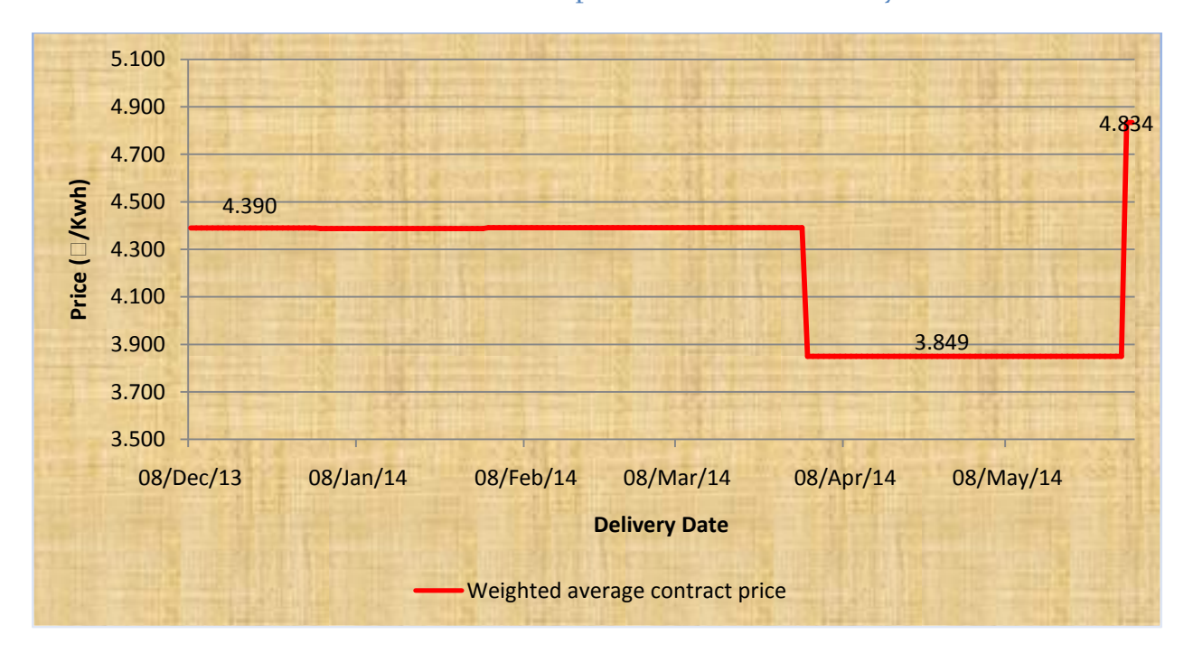
Chart 4: Forward Curve for the period December 2013 -May 2014

A forward curve reflects present day's expectation of spot prices for a future period. Accordingly forward curves have been drawn based on prices of contracts executed for supply of power for future period. Forward curve have been drawn for December 2013 – May 2014 based on 120 contracts.